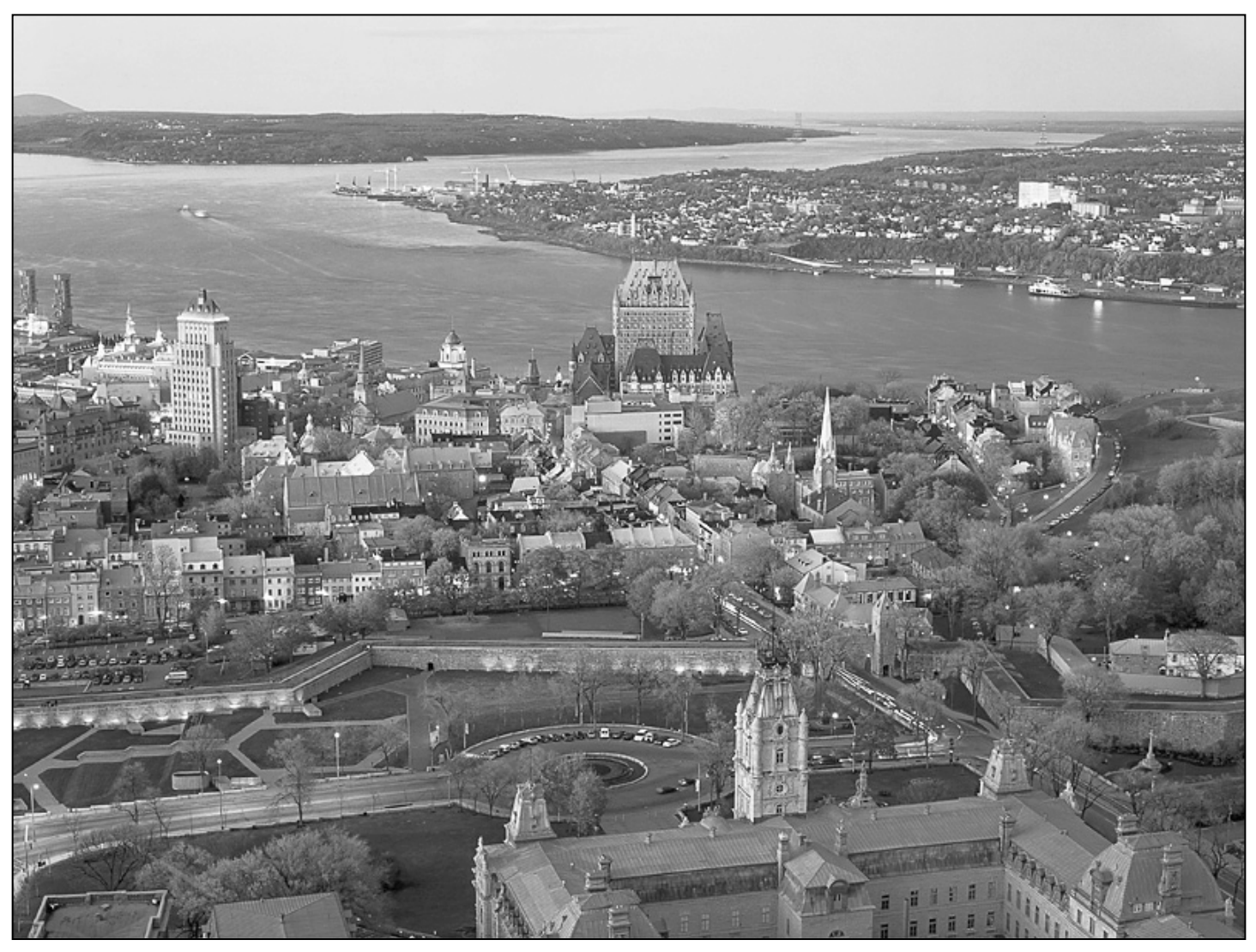
Aerial view of Old Québec.

activities of the first working-class families who lived during the 19th century in this harbour zone abounding in small wooden cottages. In the west the street is bordered by residences, while at its opposite end the commercial function is dominant, in particular around the pedestrian part of the artery which has the name Quebec Mall . Still in Port Adelaide Enfield, there is also a very short Quebec Street located in the industrial suburb of Wingfield. Because of a fire which destroyed the oldest files of the municipality, there is no information which would make it possible to identify the dates when these street names became official. However, the name was presumably allotted to commemorate the triumph of the British army at the battle of Québec. In Port Enfield Adelaide, several streets recall major British military successes.