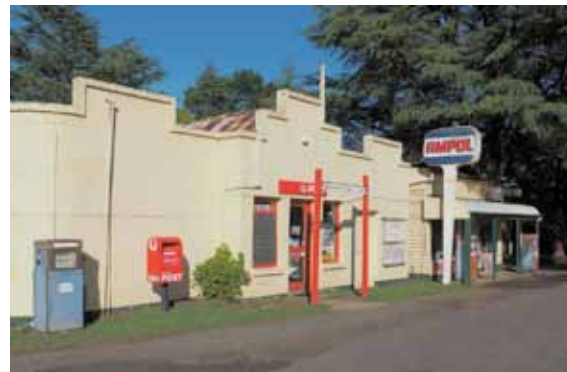
Hanlon's Store & Post Office on Bells Line of Road (2017). Est. 1927 and still owned by the family.

stocked library and cosy reading room'. 5 The building fronted the old Bells Line of Road, now called Bilpin School Lane, on the site which was to become Bilpin Public School.