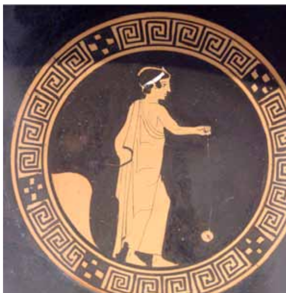
Figure 2. Greek vase painting—Boy playing with a terracotta yo-yo, Attic kylix, c. 440BC

So, at first reckoning, this seems a perfectly logical and reasonable etymology of the toponym. However, it turns out to be a classic case of a post hoc folk etymology, because the use of yo-yo in its modern sense of a toy or something 'going up-and-down' could not have been known in the mid-nineteenth century when the creek was named.