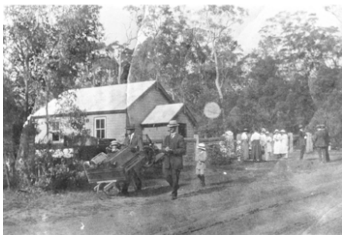
Norwood School of Arts, c. 1900—used as a public school and for church services. The portable organ is being wheeled away after church.

When Gillman Norwood acquired the property in about 1894, it was an established orchard. He named it 'Norwood'. In October 1899 Norwood was appointed the Postmaster and the office was named Norwood Post Office. The area then became known by that name even though the name Bilpin had been used (despite misspellings such as Belpin and Bilpen ) since the earliest survey. 4