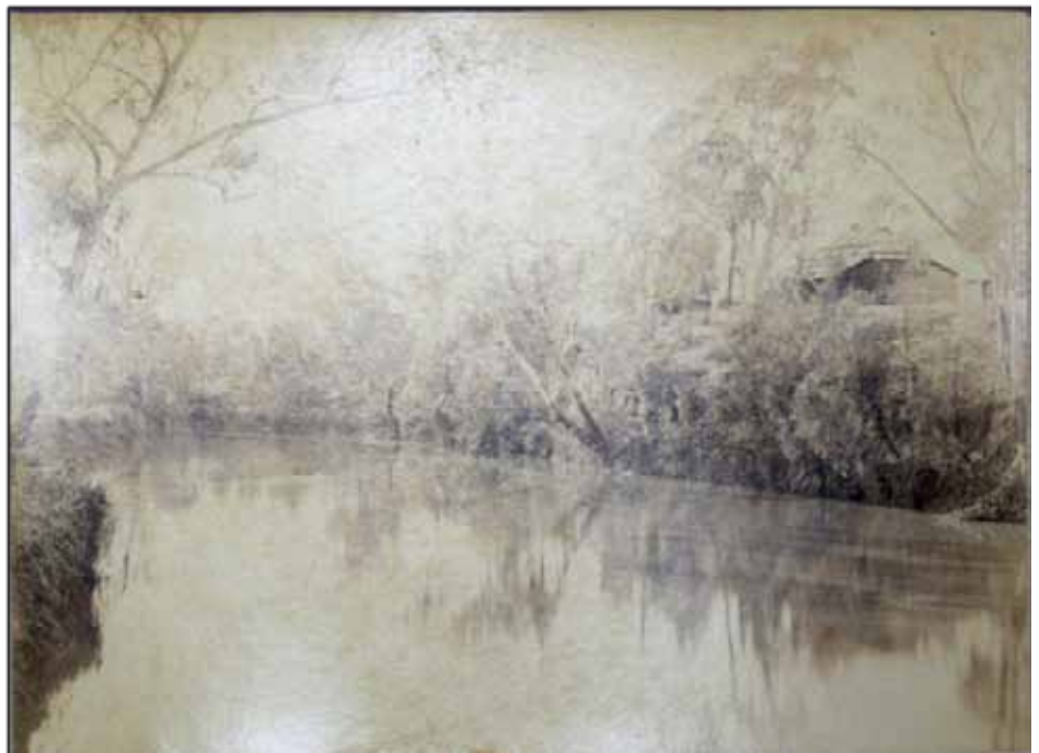
Figure 1. Native Mounted Police Camp on Yo Yo Creek (c. 1864)