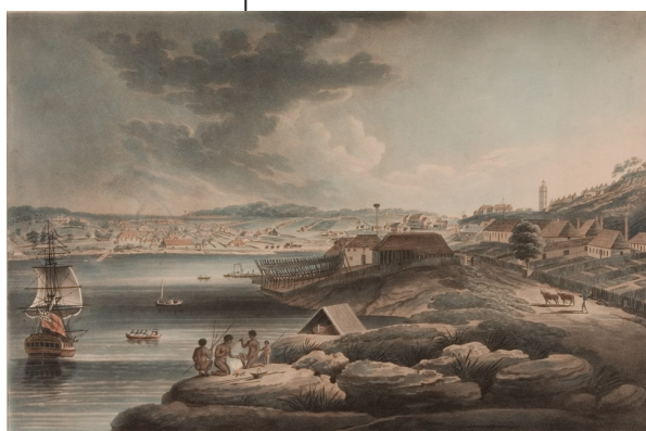
A view of Sydney Cove, New South Wales, 1804.

mate on Phillip's flagship Sirius , were emphatic that 'Sydney was the name decided on'. Indeed this name was soon entrenched by Phillip himself who invariably addressed his official despatches to London from 'Sydney Cove' or 'Sydney'. In an age when political patronage was central to career advancement, some said that it suited