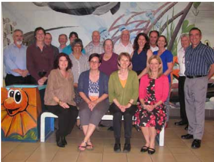
CGNA delegates pose in Townsville, surrounded by distinctive Reef Aquarium decorative art

In one of the final agenda items of the conference, the Committee agreed to a name change rather more central than usual—it recognised that its own name was rather cumbersome and styled differently from those of comparable committees. CGNA will recommend to ICSM that it become the Permanent Committee on Place Names.