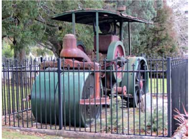
The roadroller in 'The Gardens', Blackheath, 2015. Imperial Super Diesel Road Roller, Model KV

hardly a souvenir, given that it was one metre high by 1.5 metres long and symbolically split the old track in two as it went round the gun.