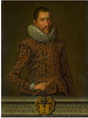
Jan Pieterszoon Coen

was too much for many, even for that violent period of history. Between 1614 and 1618, Coen secured a clove monopoly in the Moluccas and a nutmeg monopoly in the Banda Islands. The inhabitants of Banda had been selling nutmeg to the English, despite contracts with the VOC which obliged them to sell only to the VOC, at very low prices. 1 In 1621,