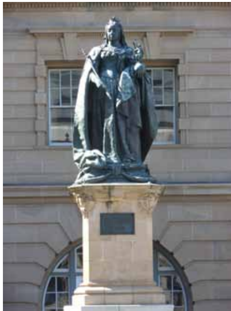
Statue of Queen Victoria in Queens Gardens, Brisbane.

Brisbane River is a meandering stream, and Brisbane (city) is sited on a bend with roads laid out in the standard grid pattern. Since the area was constrained between the