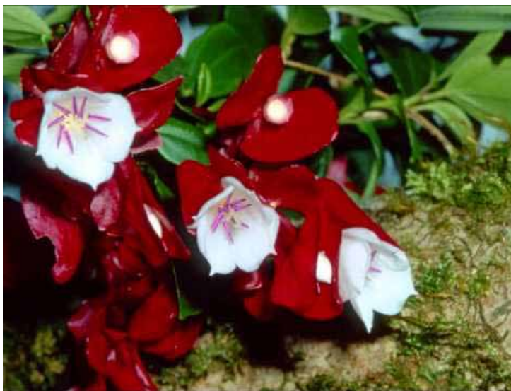
The tagimaucia, national flower of Fiji, endemic to the island of Taveuni

This means I start with the (relatively) enormous island of Vitilevu, home to the nation's capital, Suva, the second city Lautoka, the international airport at Nadi, and the bulk of the nation's industry, the major players being sugar and tourism. We will not, however, be detained long on this topic, since I have already expounded on it, in the very first instalment. Since that