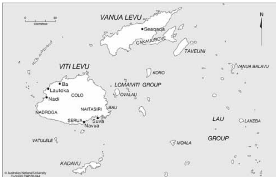
Map: CartoGIS and College of the Asia & Pacific, ANU

there is no consistency in the practice, since it seems that 'Viti Levu' and 'Vanua Levu' (see next) are the only placenames that get this discriminatory treatment: