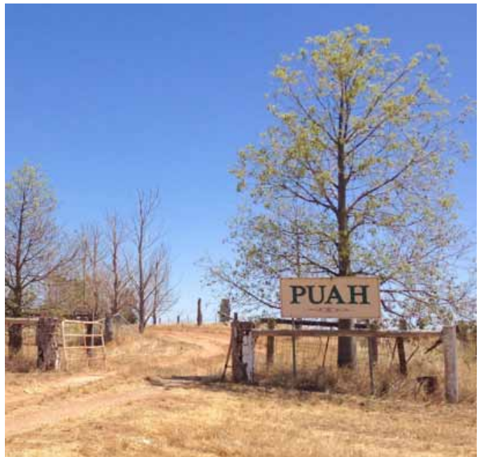
An origin for Speewah? The entrance to 'Puah' property, Speewa Road, NSW - 35°10'34"S 143°28'47"E

Hill predates the legends. Thanks to the AND, we know that the earliest record of a figurative usage is from 1890 1 , and the oral tradition would not have been established